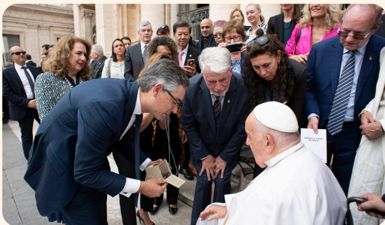
Pope Francis greets our Rome Roundtable participants at the Vatican for the launch of our Global Project, 19 June 2024

Our Rome Roundtable continued our tradition over the past 27 years of bringing together leaders from many backgrounds in various global locations, including the Vatican. Several of our Rome meetings included meetings with His Holiness, the late Pope Francis. This Latin American Pope, from the global South, constantly embraced and encouraged our work. It was a very special patronage and privilege.