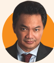
Dr Dino Patti Djalal *

Founder, Foreign Policy Community of Indonesia and Former Deputy Foreign Minister, Republic of Indonesia