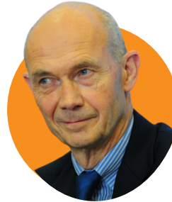
Mr Pascal Lamy Chair, Mission Board for Healthy Oceans, Seas, Coastal and Inland Waters at International Science Council & Coordinator of the Jacques Delors Think-Tanks Network, Former Director General of the World Trade Organisation