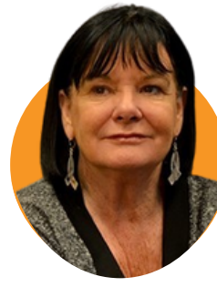
Ms Sharan Burrow AC Deputy Chair, Global Advisory Council and Co-chair, 'Shaping Global Governance, Climate and Nature' Project Steering Committee, the Global Foundation