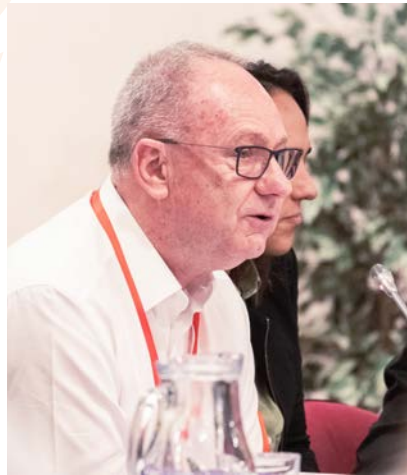
Dr Mark Cutifani CBE