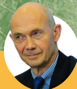
MR PASCAL LAMY Coordinator of the Jacques Delors Think- Tanks Network