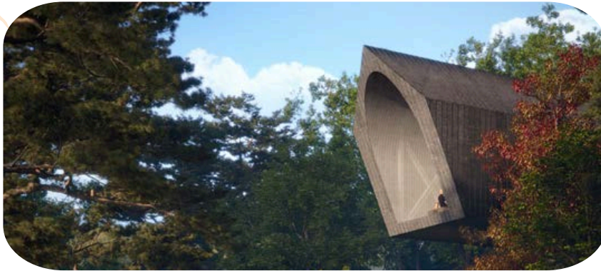
Architect's drawings for the Chapel in the Woods

For several years, with the encouragement of the Mayor of Assisi, the Foundation has convened global roundtable discussions in the beautiful Italian hillside town of Assisi; the birthplace of Saint Francis. In June 2023, the Franciscan Friars of Assisi asked the Global Foundation to support their proposal to build a new chapel in the woods of the Hermitage, a sanctuary outside of Assisi, which was an important ecological retreat for St Francis 800 years ago. A description of the project can be found here .