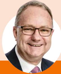
Dr Mark Cutifani CBE Chair of the Global Advisory Council