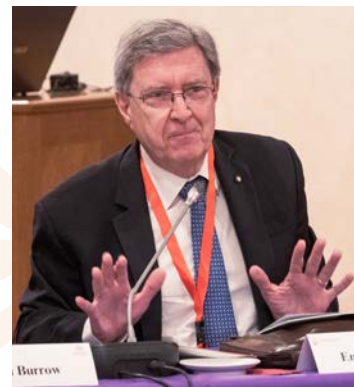
Prof Enrico Giovannini