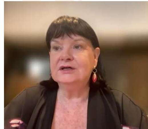
Ms Sharan Burrow