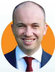
The Hon. Matt Kean - Former NSW Treasurer and newly appointed Chair of Australia's Climate Change Authority

The Foundation convened a distinguished group of its supporters for a second Australian National Energy Transition roundtable hosted by GHD. We welcomed two special guests: