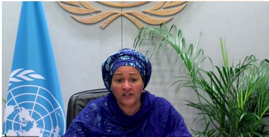
Ms Amina Mohammed

"Thank you for making this space available for many leaders that I can see on screen and that I have great respect for... The assessment of the State of the World Report by the Global Foundation was really spot on – it was a world that for all of us was filled with our inability to respond to major catastrophes." A report of the roundtable discussion is available here .