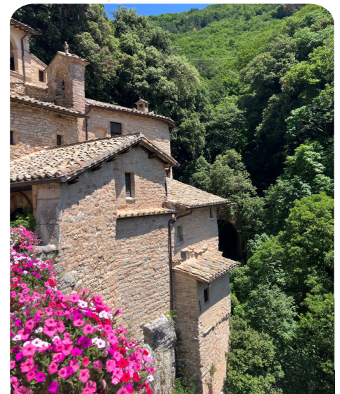
The Hermitage of St Francis, Assisi (Eremo delle Carceri)

The vision of the friars is to build a simple chapel in harmony with the natural surroundings, in honour of the tradition St Francis and his deep respect for the Earth. A beautiful design has been prepared by distinguished architects from the University of Florence using