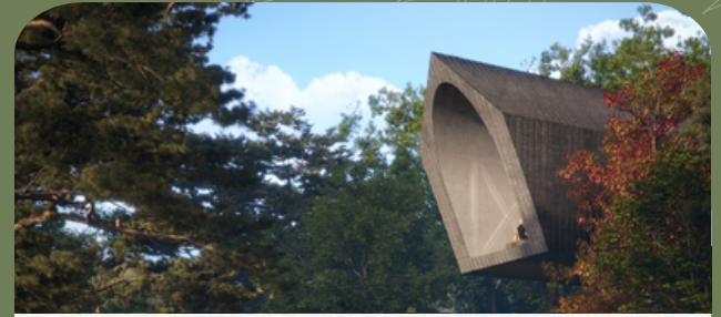
Architects design of the chapel

A detailed overview of the location, cultural significance, and artistic design of the project can be found in this video .