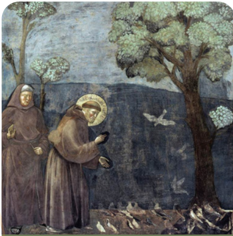
St Francis and St Clare with birds and animals, painting by Giotto di Bondone

Home to the sacred caves where St Francis retreated to pray, it is a place of beauty and spiritual power. It contains several outdoor chapels spread throughout the woods where St Francis talked to the birds and animals, and studied the stars. The Hermitage is now visitable by Franciscan friars [see here].