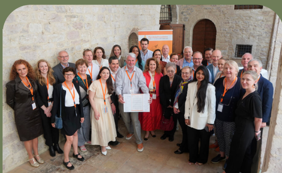
The Assisi Accord, 2022

The Foundation accepted the mayor's invitation and began convening meetings in Assisi, the most prominent of which took place in May 2022, when 50 invited participants from across the world, coming from diverse professional, social, political and religious backgrounds, met and forged the Assisi Accord , an ongoing agreement to harness global finance to incentivise investment in climate change action.