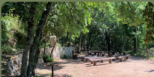
Chapel location, 2023

Additionally, the Foundation is establishing a cultural advisory committee for the project, comprising Italian and international supporters, who are providing further artistic and cultural guidance on the development of the project.