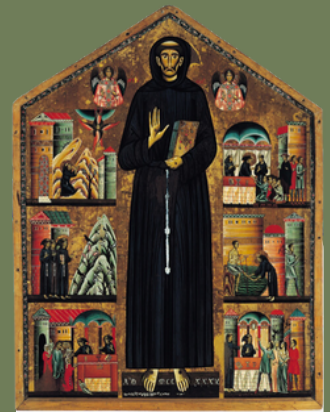
St Francis, Patron Saint of Ecology

2026 will mark the 800th anniversary of St Francis' death, an occasion for high profile activities and commemorations of national and international significance. It serves as the target date for the full launch of the Assisi project, including the official opening of the chapel in the woods.