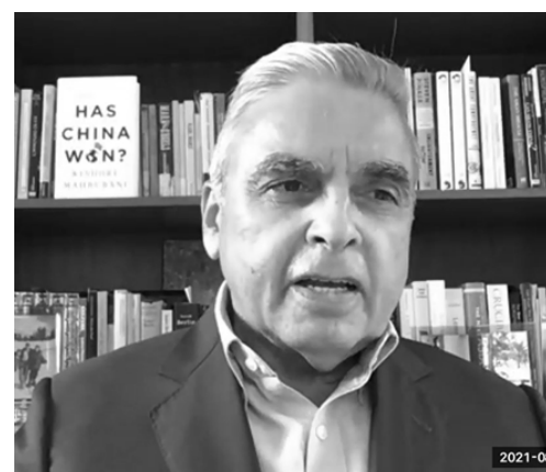
Mr Kishore Mahbubani

The digital divide and wider inequalities in societies are also threats to Asia's future. A more inclusive growth model is required to enable Asia's trajectory to be sustainable in the future.