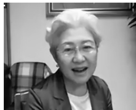
Madam Fu Ying

China perceives 'strategic distortion' by the United States, and the risk of being dragged into 'power-wrestling' , while it would much prefer to 'focus on its domestic development and neighbourhood co-operation' . The distinction was drawn between the traditional handling of 'normal