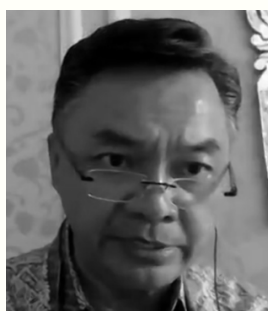
Dr Dino Patti Djalal

Resilience, as an ongoing process, should be at heart of both recovery and adaptation and help to frame future opportunities to overcome pressing challenges.