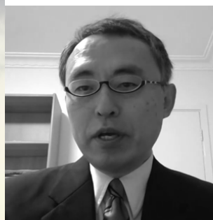
Minister Shuntaro Omura